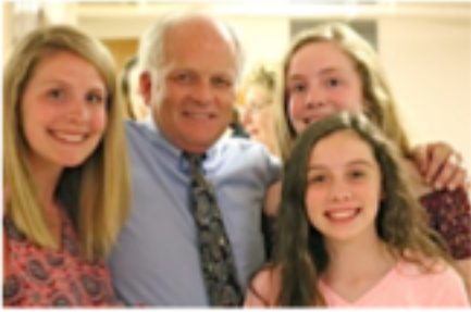
The Wonder of Youth