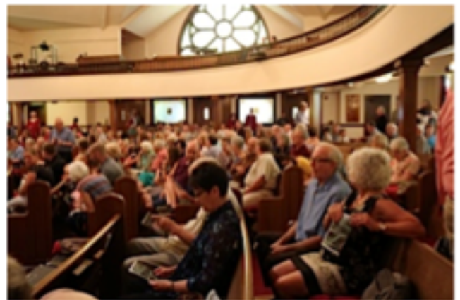
Supporting Church Family