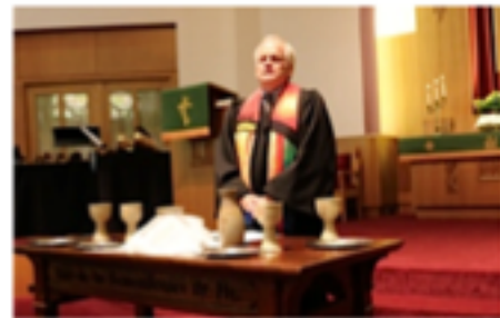
The Last Supper