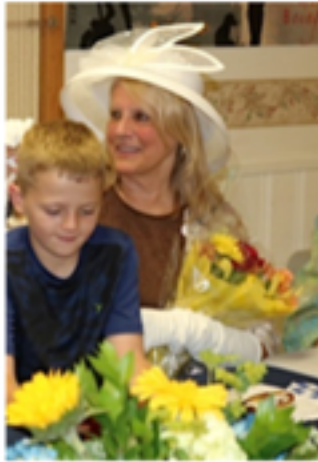
First Lady Lynne