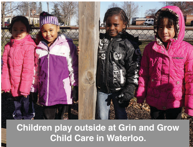
Children play outside at Grin and Grow Child Care in Waterloo.