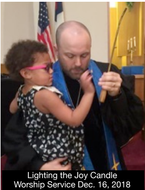
Lighting the Joy Candle Worship Service Dec. 16, 2018

Then join us here at First Congregational at 7:00 p.m. for our Longest Night Service.