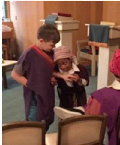
Christmas Program Rehearsal

The Hospitality House (our current Sunday School Mission) will be sponsoring a vigil this Friday from 5:30 and 6:00 pm. December 21st is a national day of remembrance for homeless persons who have passed away during the past year. Join us at COR (220 E. 4th St. and we will walk to Lincoln Park for the memorial service. You may bring hats, scarves and gloves to hang on trees in the park for the homeless.