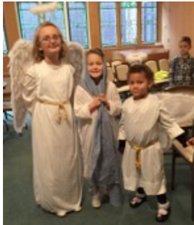
Christmas Program Rehearsal

Angels singing, shepherds herding, Kings visiting and much more!! We hope that you are able to come and join in with us in this funny telling of the true Christmas story.