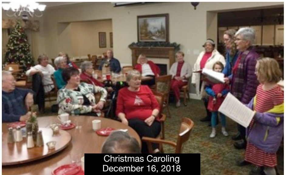
Christmas Caroling December 16, 2018